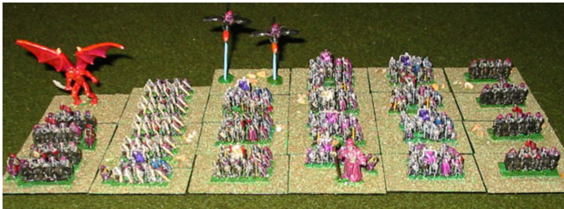
“Undead horde” another HOTT army