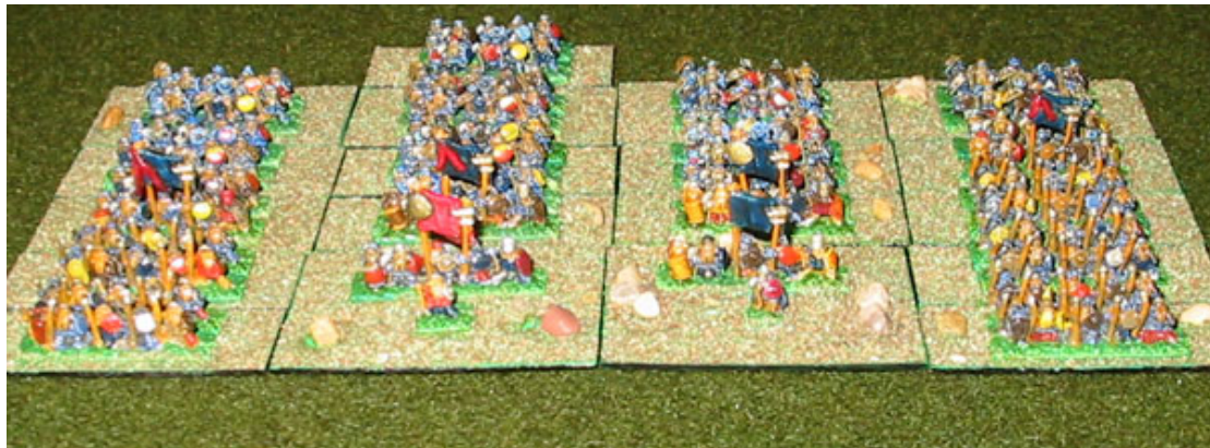
“6mm dwarves” finished dwarven army, based for the Horde of the Things rules

NOTE: Most of the figures in this guide are from Irregular Miniatures 6mm Fantasy range ( www.irregularminiatures.co.uk/ ).